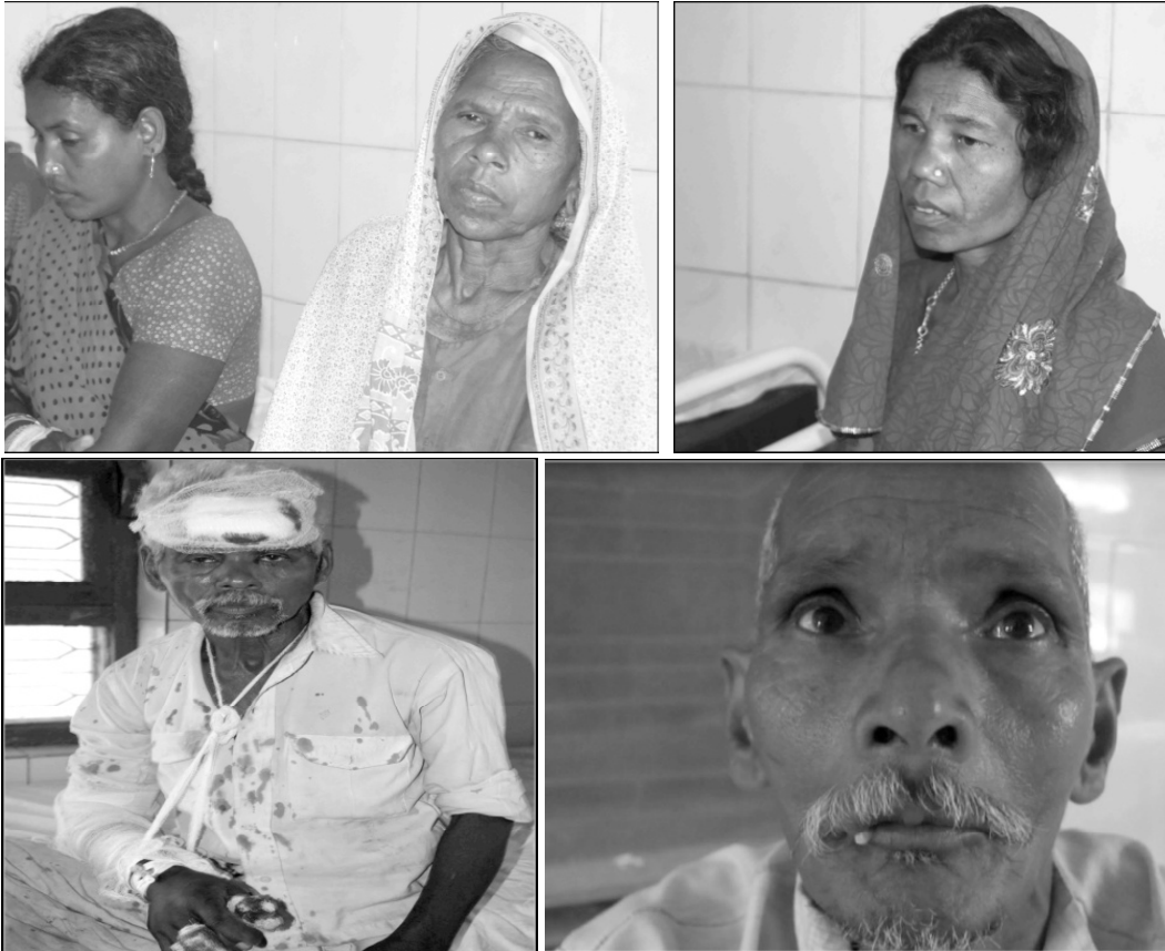
Image : Injured villagers at the Sir Sunderlal hospital , Dudhi.