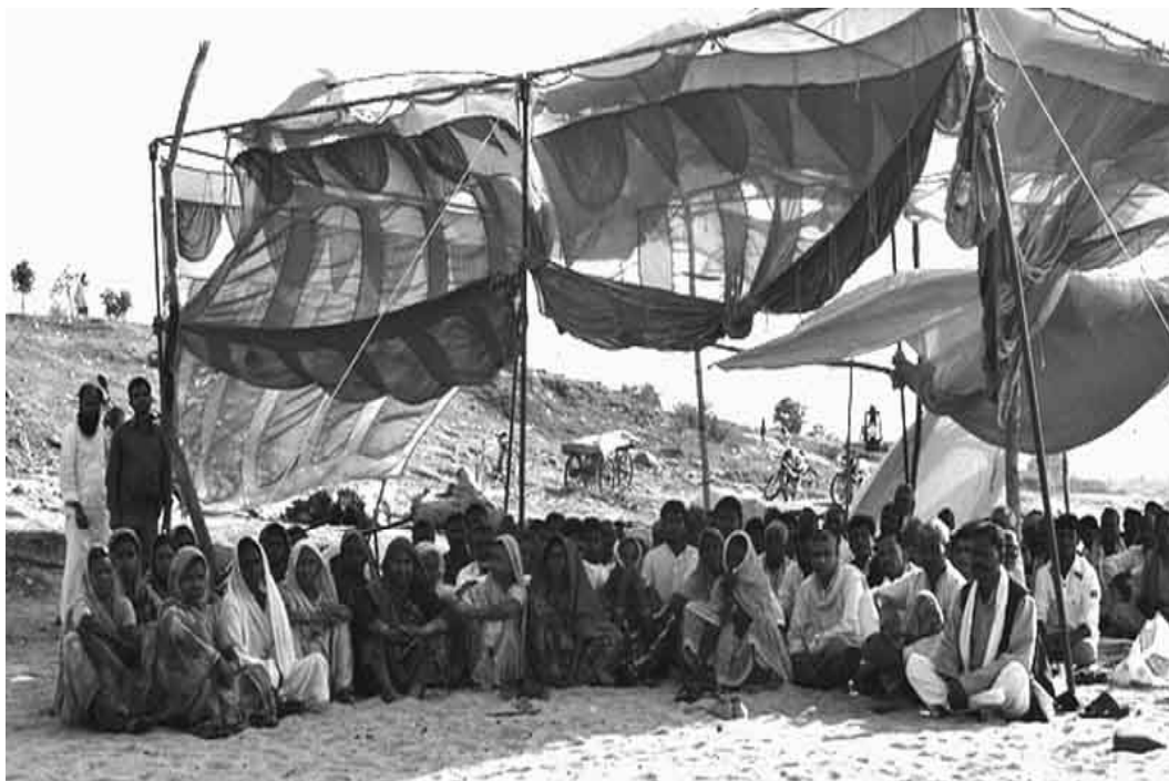
Dams Built on Rivers of Blood

fied as forest land and is under the control of forest department whereas this is the same district that is doing far poor in implementing the Forest Rights Act (FRA) that got passed in the year 2006. The irony of Sonbhadra is that, on the one hand most of the forest land is diverted towards industrial and mining use and to dominant caste people, on the other hand the majority of dalits & adivasis are made to live in constant fear of forest department and the district officials and are tagged as 'encroachers' and 'Maoists' which is in itself contentious under the FRA as well as under the Indian constitution. There have been reports of widespread violence against the adivasi and dalit communities demanding their rights under the FRA 2006.