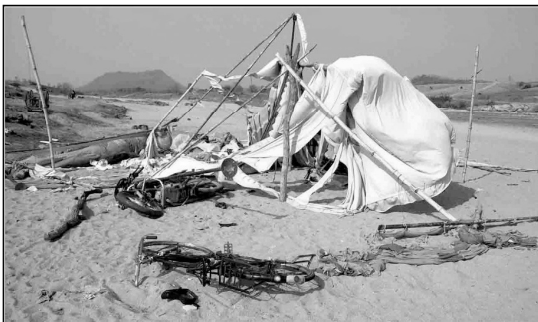
Image : The tent which was set by villagers during the protest was vandalized and uprooted by the police

This is a well-known strategy of the Sonbhadra district administration as it has been the case in evicting most of the adivasi communities who are resisting the violation of Forest Rights Act, 2006 and demanding the state to implement the FRA.