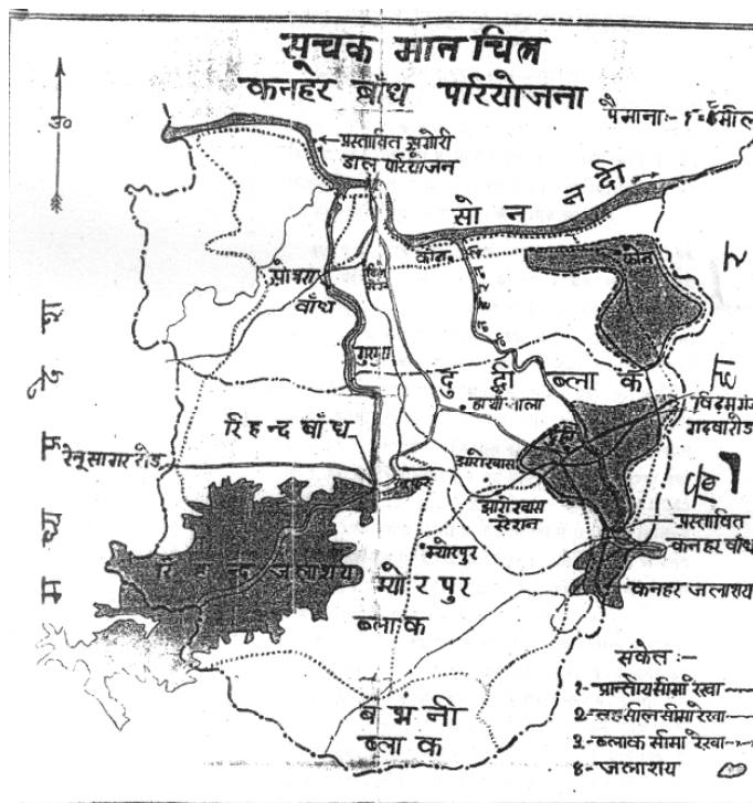
Image: Kanhar dam Project information map

The project is expected to provide irrigation to Dudhi and Robertsganj Tehsils via left and right canals emerging from both sides of the dam with capacity of 192 and 479 cusec respectively. The culturable command area of the project is 47,302 ha. The project imposes enormous threat not only to the environment and ecology but also to thousands of tribal families of Vindhyas living there since hundreds of years and has demanded for protection of their forests and proper implementation of R & R (Rehabilitation and Resettlements). "Nearly, 7,500 families from 25 villages will have to be re-settled. The preliminary figures estimates that 9 lakhs trees, 2500 kuccha and 200 pucca houses, 500 tube wells and about 30 government schools along with some other buildings and essential amenities shall be submerged under the water. Land admeasuring around 3,000 ha will have to be submerged as per newsletter Update on Dams, Options & Related Issues of South Asia Network on Dams, Rivers and People. However, it is also stated that the project fact sheet of 1998-99 shows submergence of increased area i.e. 4,131.5 ha." 1