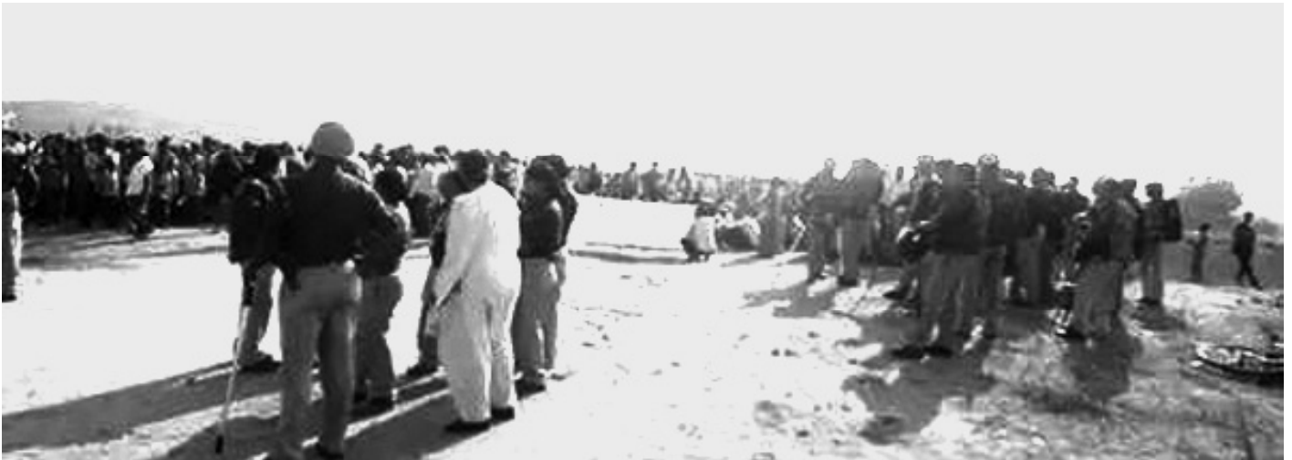
Dams Built on Rivers of Blood

and the dominant caste-class groups had already been visible in many areas in Kaimur regions .The violent attack on the Kanhar movement has made this an open reality with the active support from the govt. establishment, mainstream political leaders and even from the local media. All these dominant forces are now bent upon to break the alliance of affected people by luring the OBC members with the promise of better compensations and job opportunities. This dynamics of class-caste conflict will be the determining factor for the future course of the movement and activities. As river Kanhar flows the conflict of interest groups will also grow."